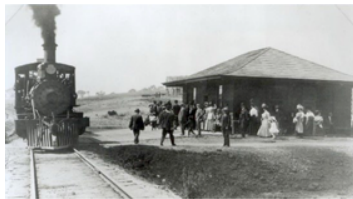
The first train arrived in 1908.

If you want to know more about this quirky little community we call El Granada, you have TWO chances this fall! You will learn about the early history of the area, the